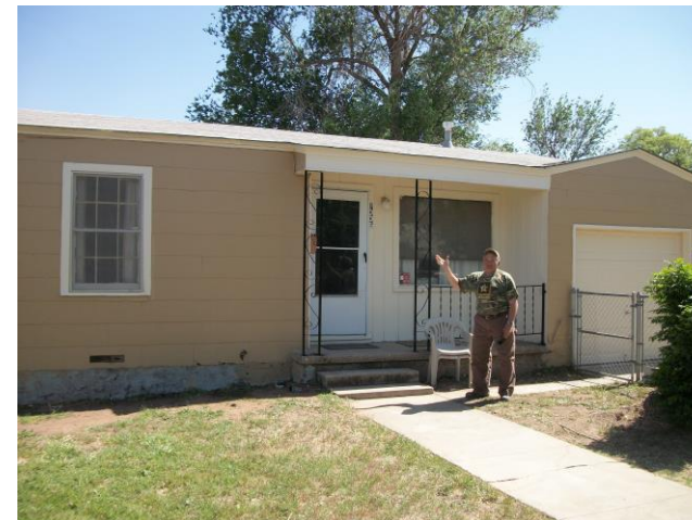
Saturday the CIA Project